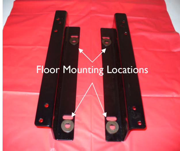
Figure #1: 2 pc. Seat base with washers

1. Install suspension seat to cab floor mounting locations, using existing seat mounting bolts with a 13/8" washer (provided). Position washers on the top side of the seat base, as shown in figure #1. Then secure the seat base to the cab floor by fastening the bolts to the cab floor. If possible use front-most set of holes to position seat further rearward in the cab.