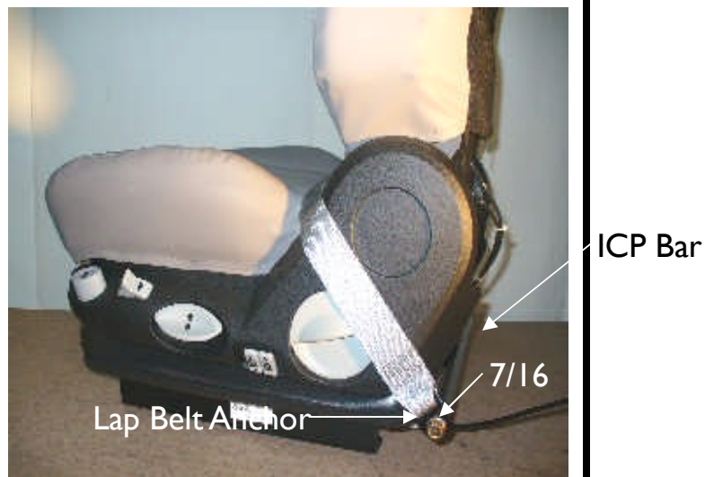
Figure #3: Attachment of the lap belt anchor to the ICP bar.

3. Attach existing lap belt anchor to ICP bar on the correct side of the seat, left side for drivers and right side for passengers. See figure #3. Torque 7/16 bolt (provided) to 45Nm. DO NOT attach floor mounting tethers to ICP Bar, attach them to the seat base (riser).