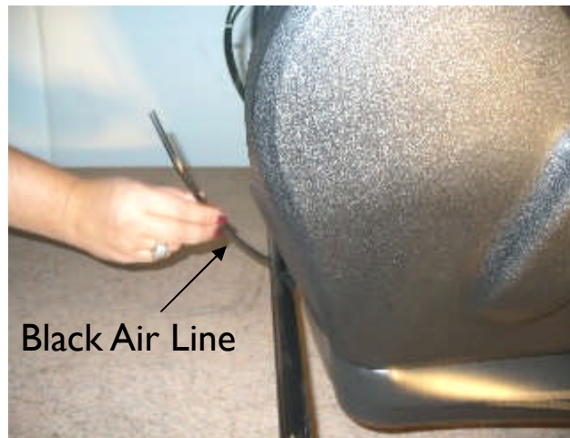
Figure #4: Black air line found at the rear of the seat.

4. Attach the truck cab air line to the black air line found at the rear of the seat. see figure #4. Make air line connections using standard 1/4 inch, DOT approved fittings. Check air line connection for leaks.