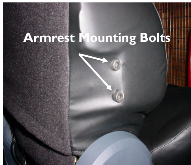
Figure #5: Armrest mount location

5. Attach armrest (if equipped) to mounting holes located on the seat back frame. Armrest mounting bolts are already installed in the mounting holes. Locate the bolts and cut the fabric around the head of the bolts, as shown in figure #5. Fasten armrest to back frame using the two M8 bolts provided, re-install the bolts in the same location from where they were removed . Torque to 25Nm.